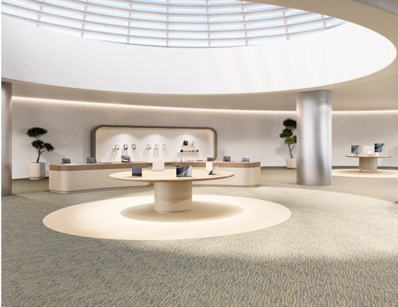
RAY 528, OPULENT 150